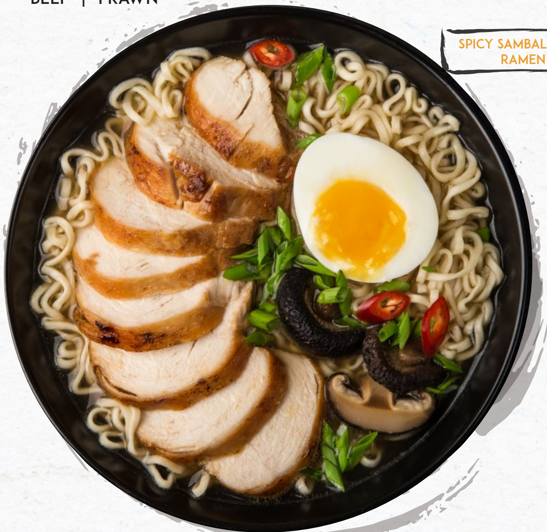
SPICY SAMBAL CHILLI RAMEN

All prices are in AED inclusive of 7% municipality fees, 10% service charge and 5% VAT Kindly inform your server for any dairy ,gluten, nuts, seafood or other allergies (S) Spicy | (G) Gluten | (D) Dairy | (N) Nuts | (V) Vegetarian | (A) Alcohol | (F) Fish | (SE) Sesame Seeds (SO) Soya Bean | (CR) Crustaceans | (E) Egg | (C) Celery | (P) Peanuts