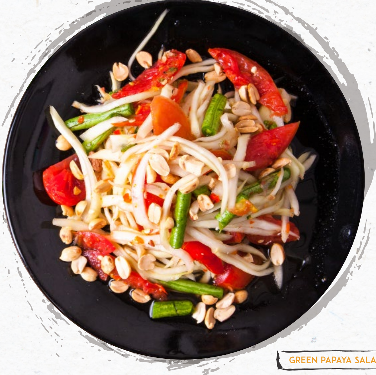
GREEN PAPAYA SALAD