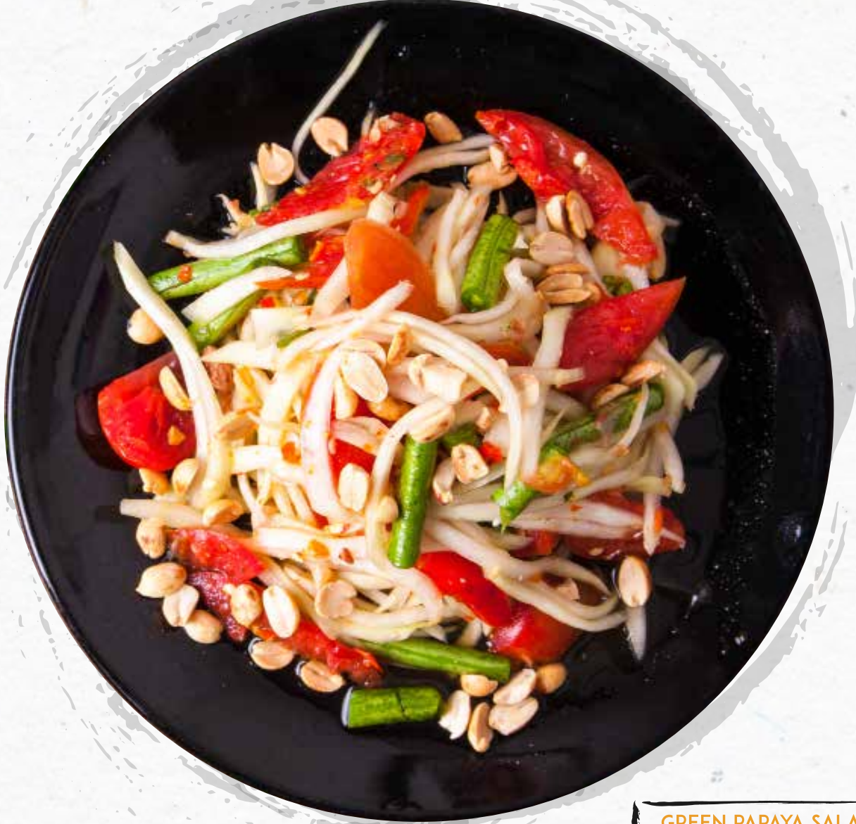
GREEN PAPAYA SALAD