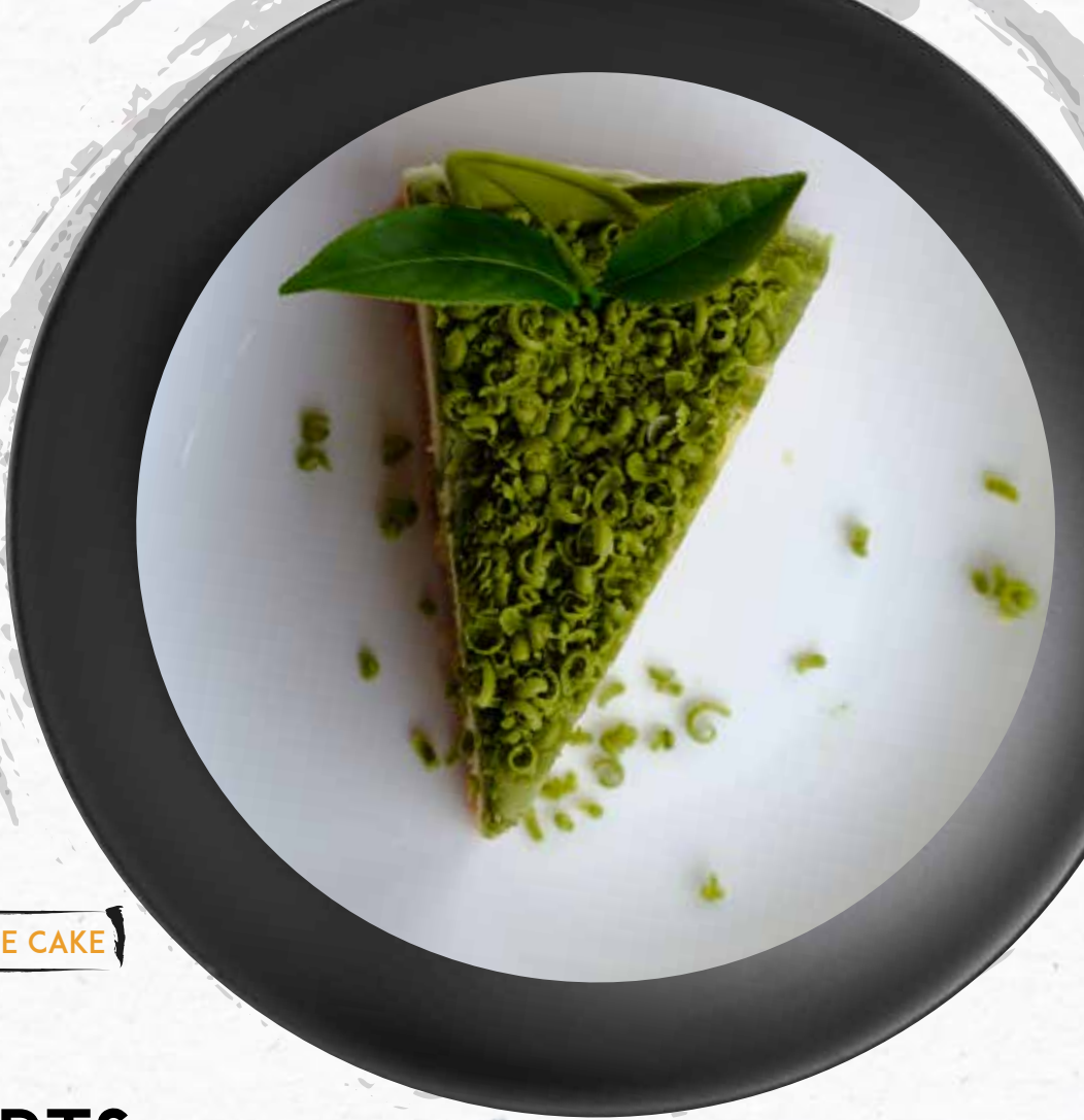
MATCHA CHEESE CAKE