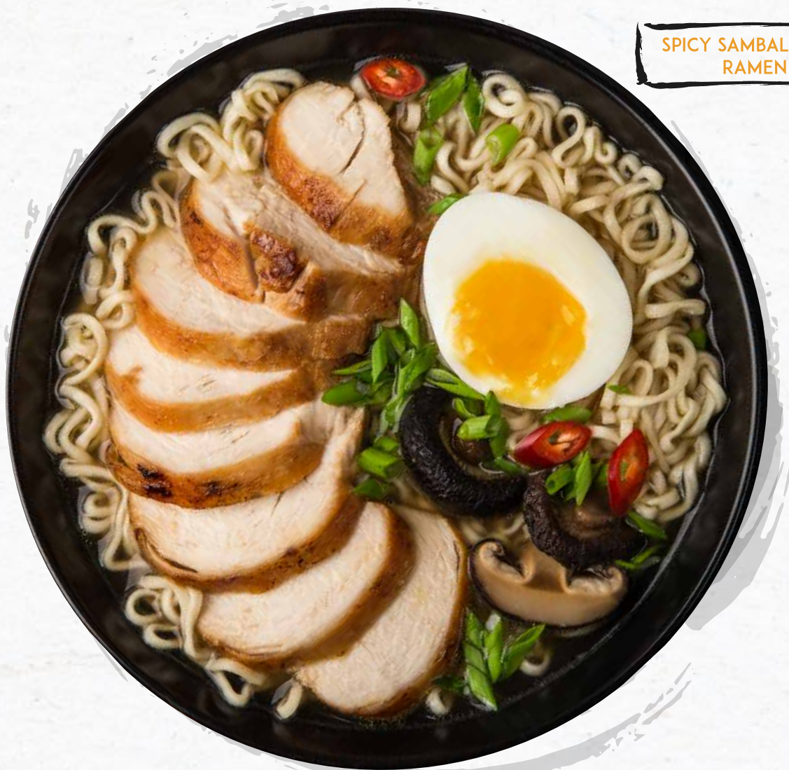
SPICY SAMBAL CHILLI RAMEN

All prices are in AED inclusive of 7% municipality fees, 10% service charge and 5% VAT Kindly inform your server for any dairy, gluten, nuts, seafood or other allergies